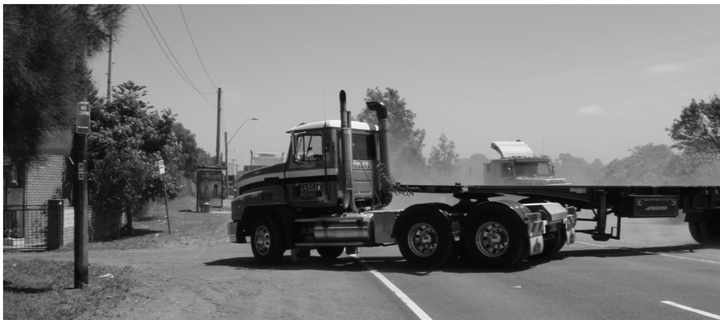
Entry to Botany Cemetery, Bunnerong Road

Summer 2006 Randwick South Ward Enviro News from Botany Bay and Catchment Alliance www.botanybay.info Protecting Environment=Protecting People