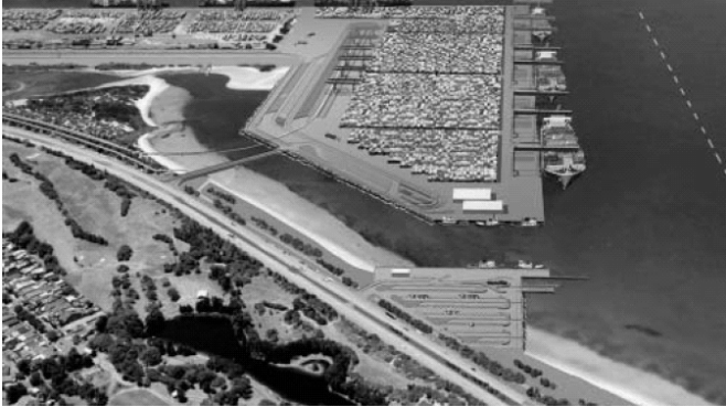
2011 view of new Port terminal, Boat and Tug Ramp, and Penrhyn