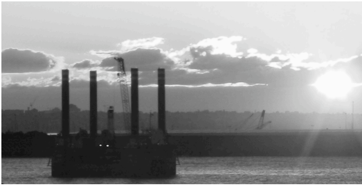
Platform in Yarra Bay, August

Premier Nathan Rees has said that whales would avoid the structure when they return from northern waters in spring. "I have every confidence the whales will swim around it," he said.