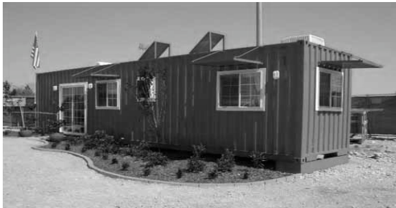
A repositioned empty container post peak oil

IPART and the Government are ignoring the empties problem, but it is growing fast – 12.9% higher than 2006/7 – and in the 2007/08 financial year 486,768 empty containers (TEUs) were exported through Port Botany.