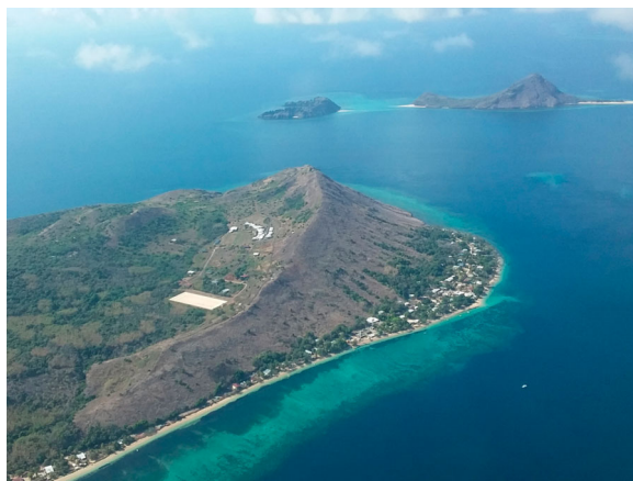
FIGURE 1: Western part of Mer (Murray Island) and the neighbouring islands of Waier (L) and Dauar (R), 1 December 2016.