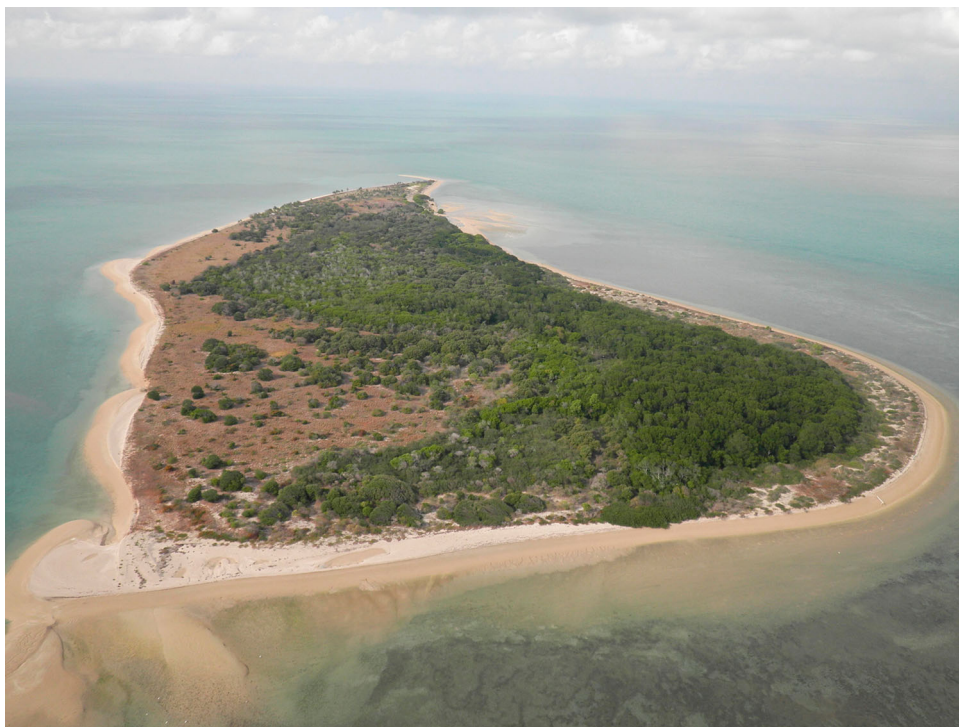
FIGURE 2: Tudu (Warrior Island), 15 November 2016.

La Pérouse 40 – with his discoveries at Vanikoro, perhaps he considered this task largely completed.