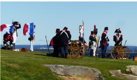
La Brigade Française