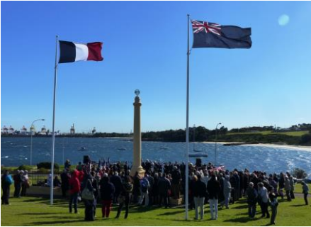
Ceremony at the Monument

Bastille Day this year was hosted by Randwick Council's La Perouse Museum & Headland Trust in conjunction with The Friends. All financial members of the Friends were invited to attend the function.