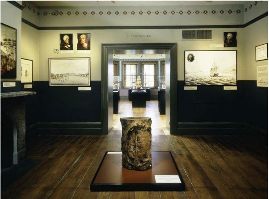
The original entry to the Lapérouse Museum 1988